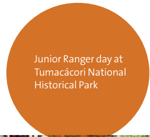
Junior Ranger day at Tumacácori National Historical Park

Learning and growing are lifelong endeavors, and the national parks are a wonderful resource for furthering education. Visit a national park near you and learn something new!